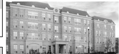
Retirement & Assisted Living -maainc

1995/97 Wheeler & Associates [www.wheelerassociates.ca]