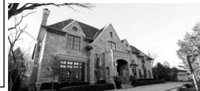
New Custom Residential -maainc

1999/2001 Student Design Clinic [www.studentdesignclinic.ca]