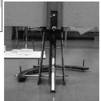
Ind. Designer: Student posting easels